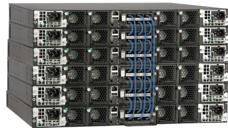
Figure 4: Up to 12 Ruckus ICX 7750 Switches can be stacked using up to 12 standard full-duplex 40 Gbps QSFP+ ports per switch, providing up to 5.76 Tbps of aggregated stacking bandwidth.

Ruckus Multi-Chassis Trunking (MCT) supports dual homing of wiring closet access switches, or servers in a rack, to two Ruckus ICX 7750 switches in an MCT peer group, eliminating the risk of a single point of failure. In conjunction with MCT, VRRP-E (the Ruckus extension to VRRP for MCT) provides redundancy and sub-second failover for both Layer 2 and Layer 3. For metro or campus deployments in a ring topology, the Ruckus Metro Ring Protocol (MRP-I and MRP-II) prevents Layer 2 loops and enables faster re-convergence than Spanning Tree Protocol (STP) with sub-second failover.